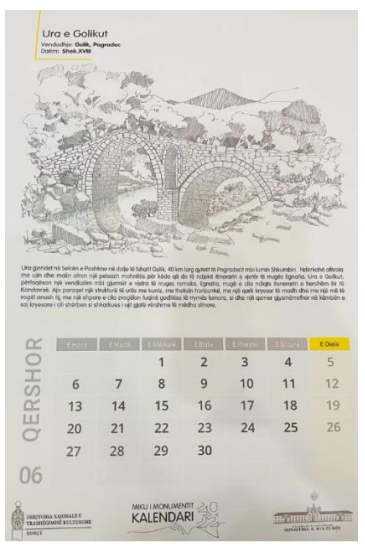
2022 Calendar with sketches from Monuments of Culture for example 'Ura e Golikut', 'Banesa e Vellezerve Icka'